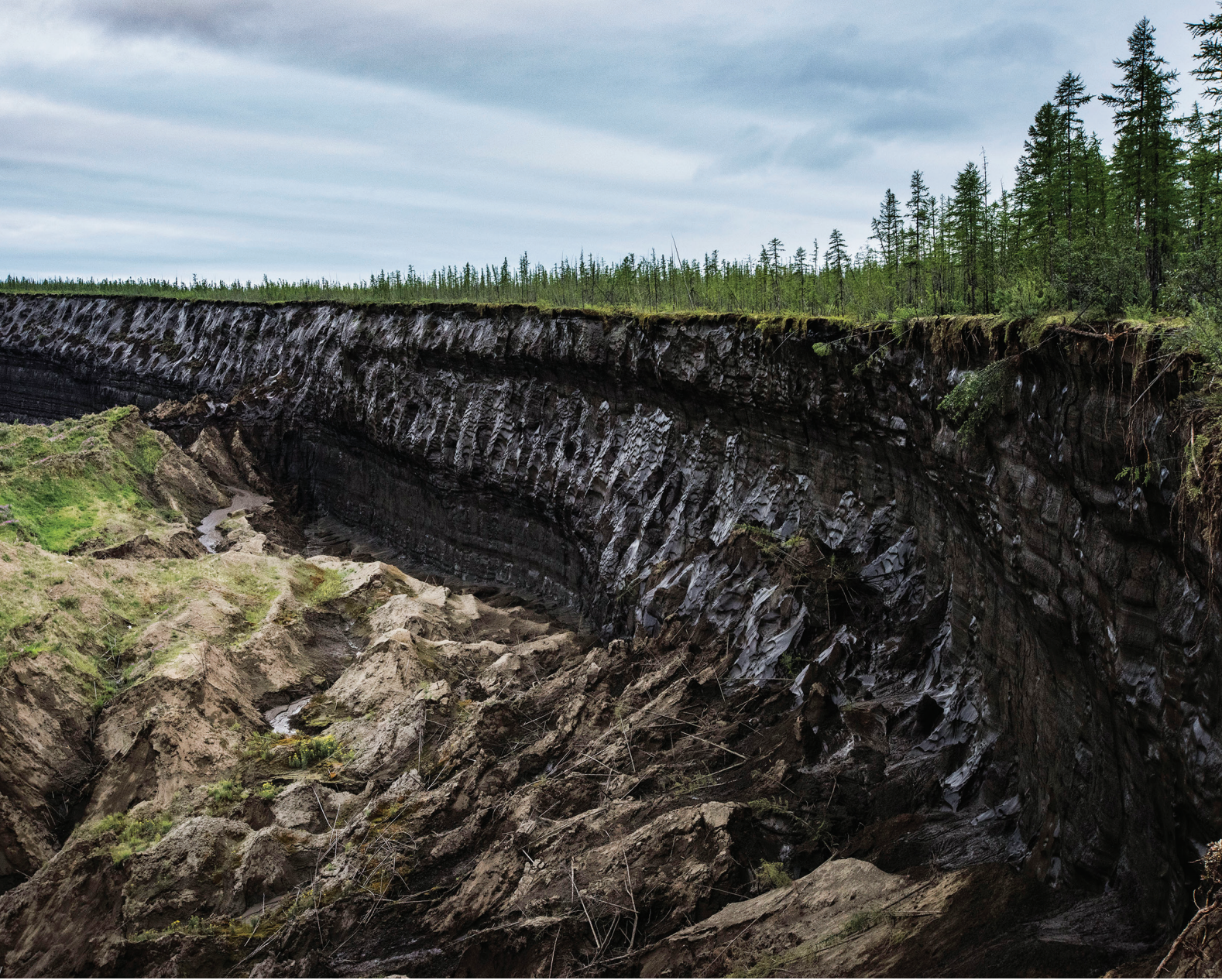
The Batagaika crater in eastern Russia was formed when land began to sink in the 1960s owing to thawing permafrost.