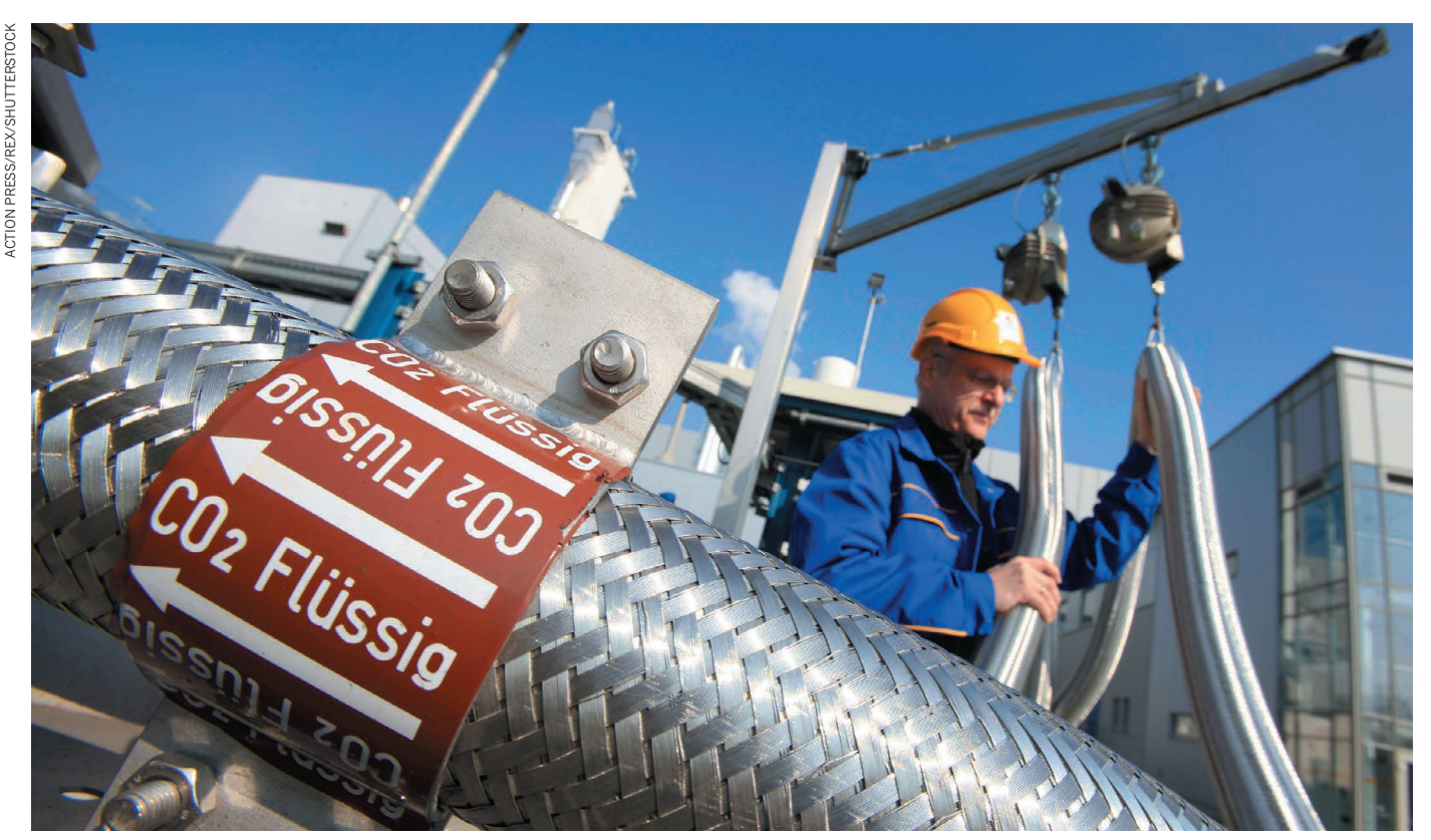
A pilot project in Spremberg, Germany, aims to capture carbon dioxide released from power stations.

NATURAL CAPITAL Guidelines, respect and time can reconcile diverse views p.309