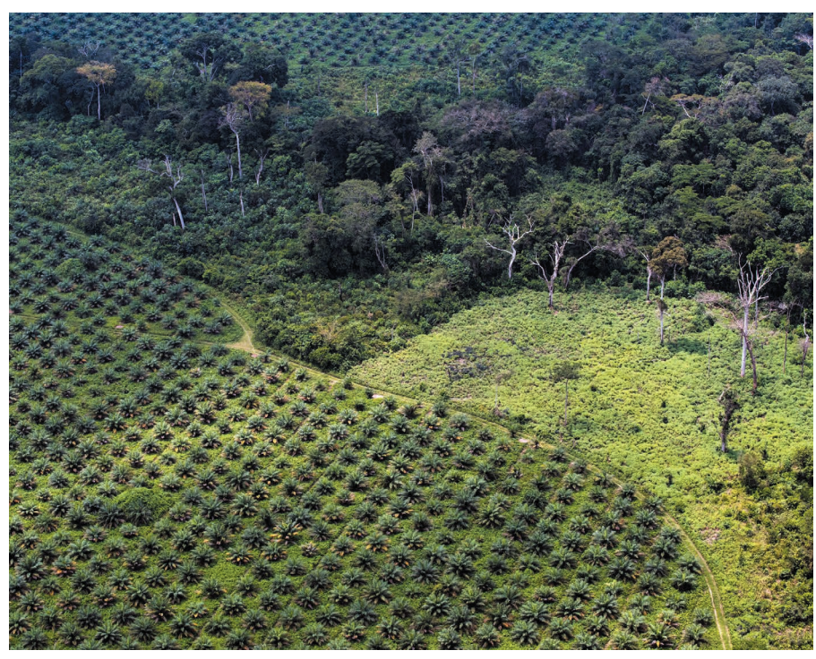
A palm-oil plantation in the Democratic Republic of the Congo encroaches on nearby rainforest areas.

Meanwhile, modellers inevitably make value-laden assumptions in charting different policy pathways, including the range of options being considered, such as rapid technological development or nuclear energy. Assumptions also include the political, economic and demographic stories behind