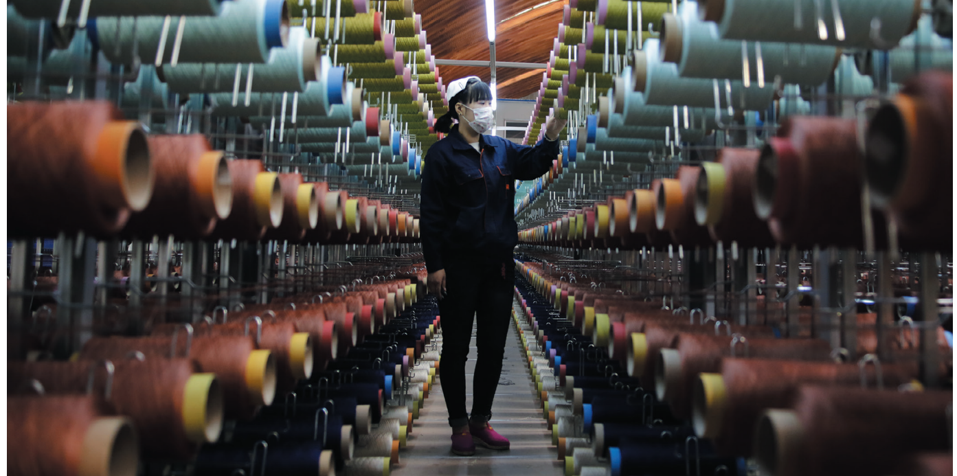
A worker checks polyester fibres made from waste plastic bottles in Binzhou, China.

PUBLIC HEALTH 'Stolen colon' Twitter storm gave big boost to cancer awareness p.161